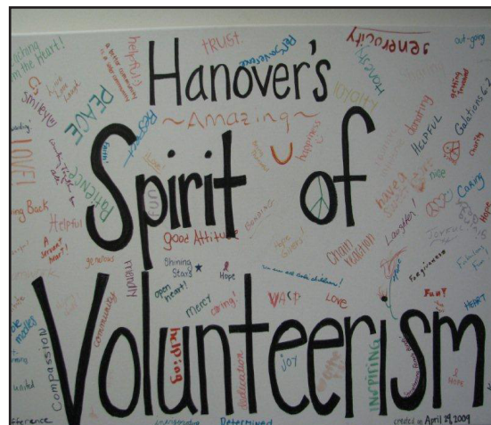
The Collaborative Art Project conducted during the 2009 Spirit of Volunteerism Celebration speaks to Hanover volunteers in proud fashion!